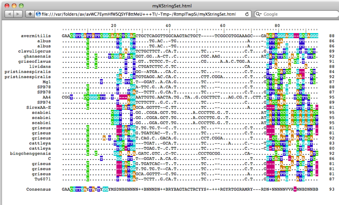
Figure 2: Amplicon with the target site for each primer colored

[1] TRUE > amplicon <- subseq(dna, 247, 348) > names(amplicon) <- desc > # only show unique sequences > u_amplicon <- unique(amplicon) > names(u_amplicon) <- names(amplicon)[match(u_amplicon, amplicon)] > amplicon <- u_amplicon > # move the target group to the top > w <- which(names(amplicon)=="avermitilis") > amplicon <- c(amplicon[w], amplicon[-w])